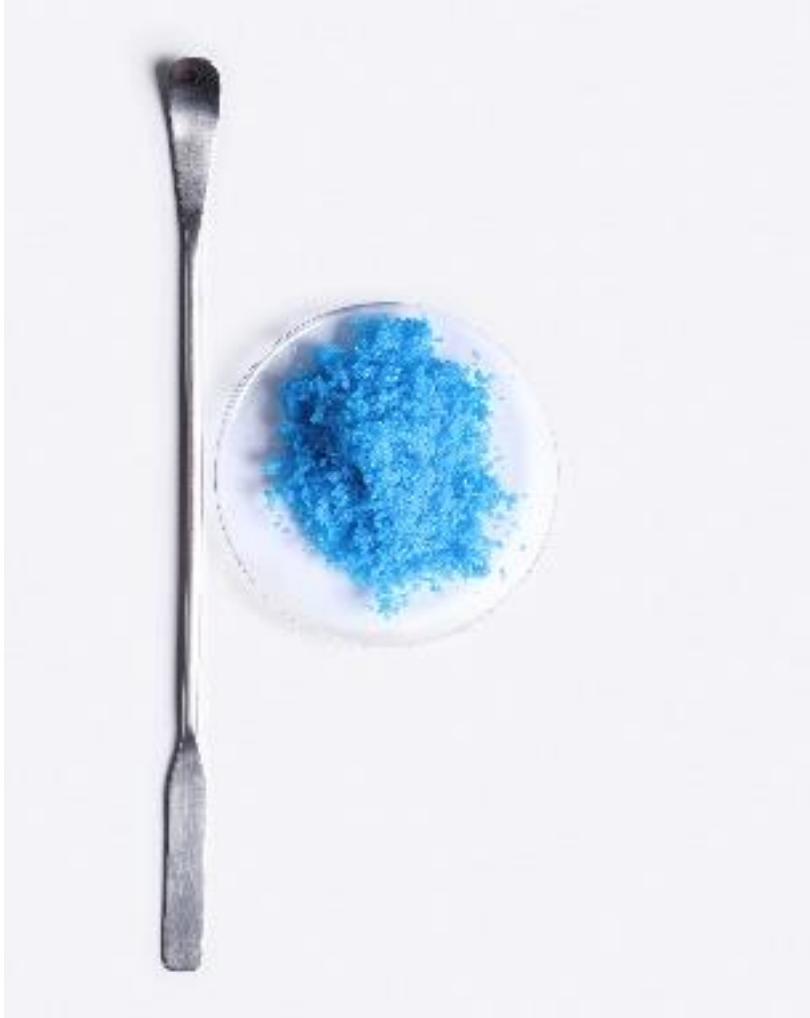
Image 1: Solid mixing is one of the most common and challenging processes for many manufacturing industries.