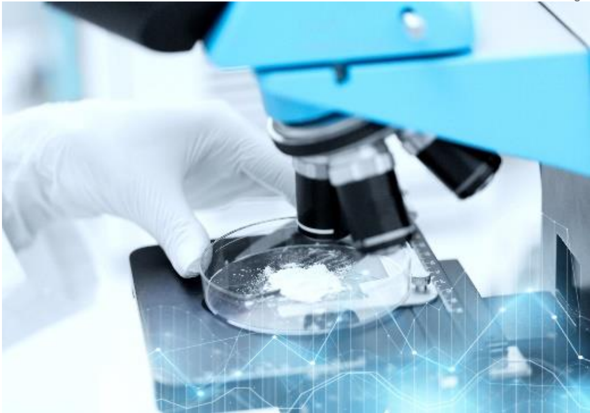
Image 3: PAT-driven automated applications can stop mixing processes at the right time as well as adjust processing conditions on-the-fly.