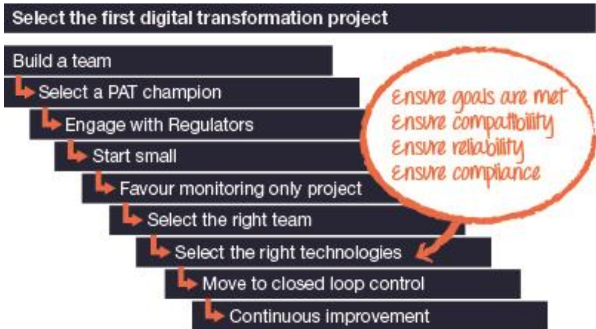
Image 2: Key elements to put in place to set the foundations for a successful data-driven application based on PAT.