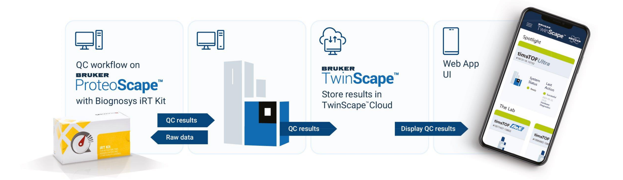
Fig. 1. Overview of the quality management workflow integrating Biognosys iRT kit, Bruker ProteoScape data processing and automated upload and monitoring with TwinScape.

When combined with standard reference materials, such as the Biognosys indexed Retention Time (iRT™) kit containing reference peptides, and Bruker ProteoScape™ software for proteomics data analysis, TwinScape significantly enhances the quality management capabilities of modern proteomics laboratories. It also allows for longitudinal tracking of data quality, ultimately leading to improved results in proteomics analyses