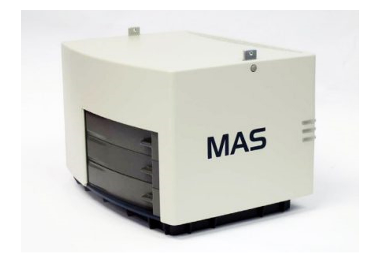
Fig. 3 MAS 3 Magic Angle Spinning Unit

Depending on which type of probe is connected to the spectrometer, the correct drive and bearing pressure profiles are automatically selected to ensure smooth spin-up and stable rotation. The MAS 3 unit is used for CPMAS, HRMAS, and MAS CryoProbes.