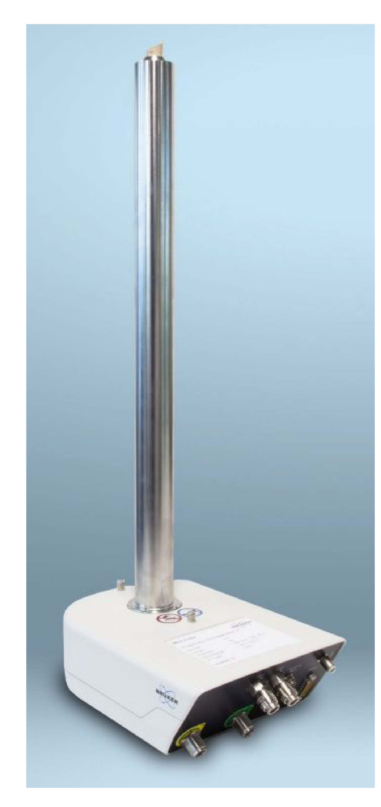
Fig 1: Bruker CPMAS iProbe

High Resolution Magic Angle Spinning (HRMAS) is the ideal technique to investigate many important classes of samples, such as gels, emulsions, foodstuffs, or biological tissues. With standard solution-state NMR techniques, the spectra of such samples would suffer from broad and unresolved resonances. By spinning at the magic angle, line broadening effects are removed, enhancing spectral resolution. Bruker's HRMAS iProbes are equipped with a gradient coil and a deuterium lock channel. The gradient makes a wide variety of NMR techniques accessible, including gradient enhanced solvent suppression and artefact-free homonuclear and heteronuclear 2D experiments.