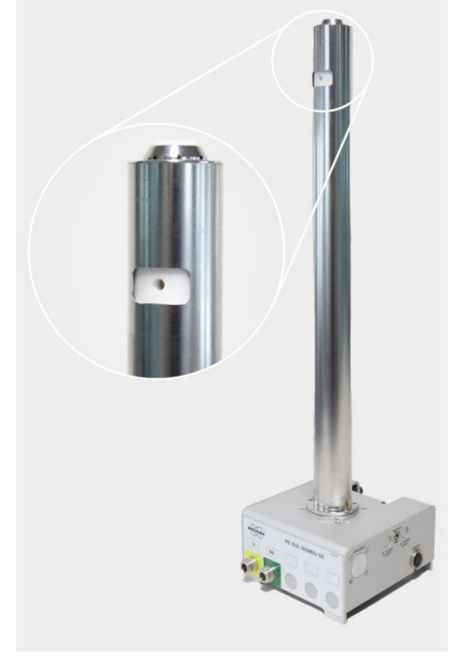
Fig 5: Bruker SB Static Probes