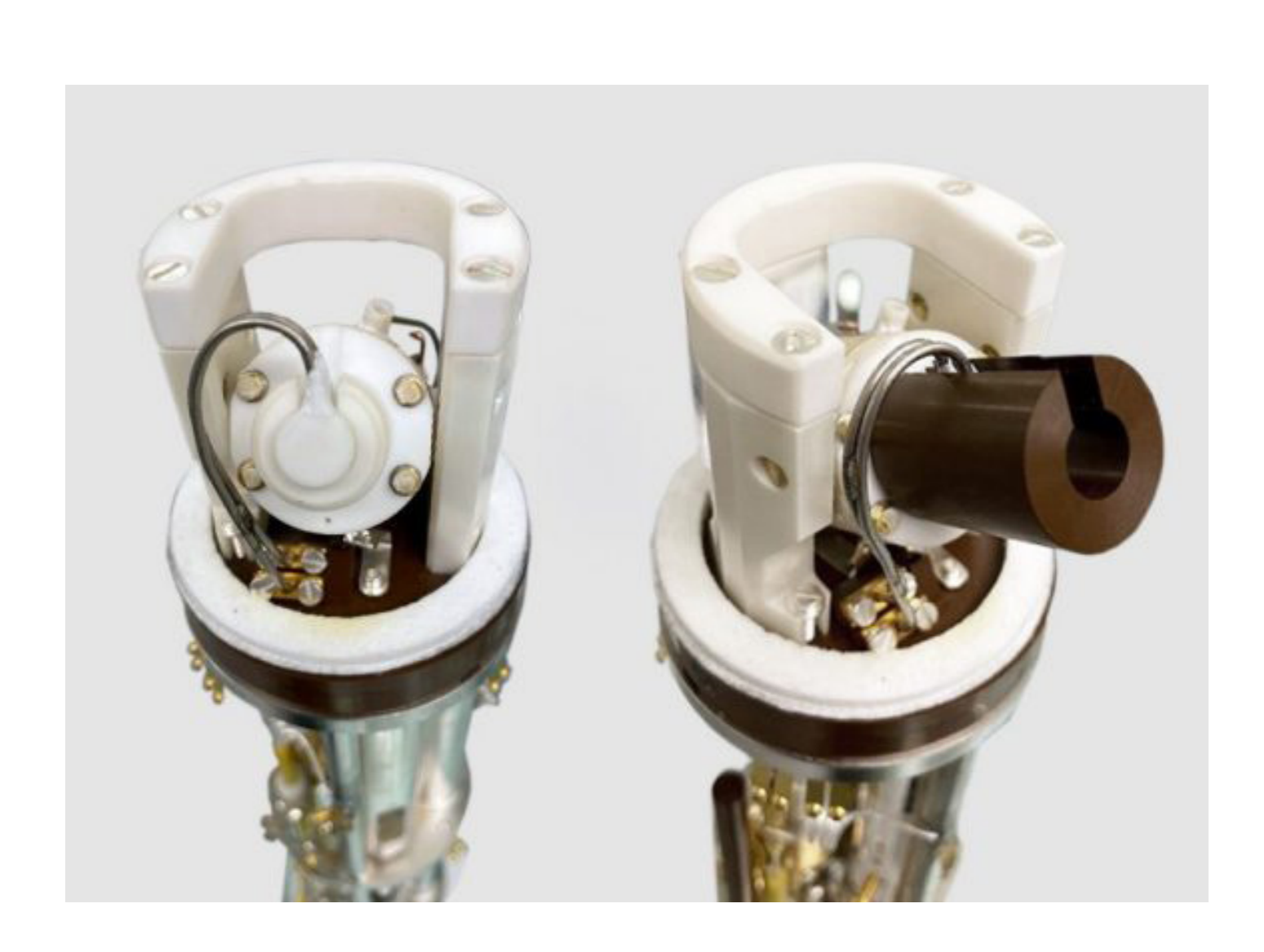
Fig 4: Bruker MASCAT Probes

As another example, Figure 5 shows a Bruker probe for static solid-state NMR. The samples are inserted into a cavity in the probe which is perpendicular to the magnet's B0 field. Compared to Magic Angle Spinning (MAS) probes, static solid-state probes have a larger sample volume and longer RF coils, which both contribute to enhanced sensitivity.