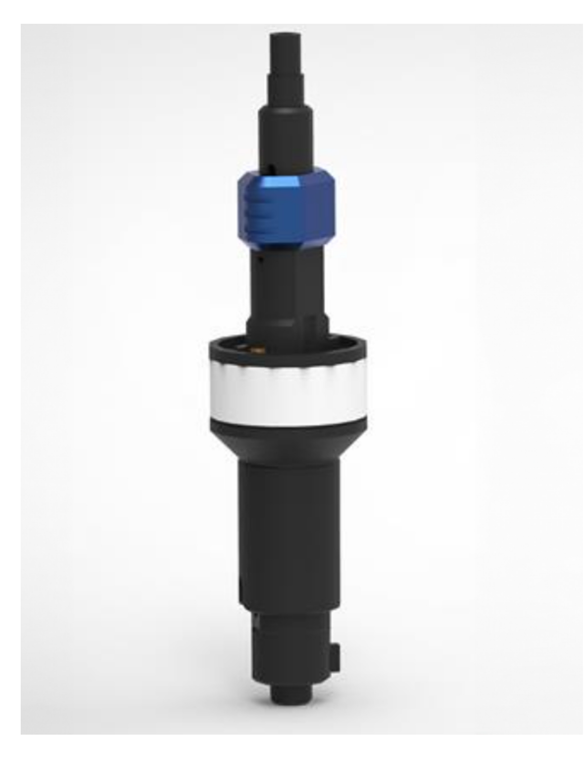
Fig 2: Bruker MAS Shuttle