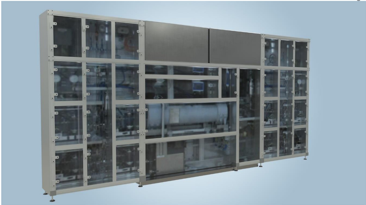
Image 1: Continuous processes can help pharmaceutical manufacturers enhance product quality, productivity and efficiency, yet they need to be able to provide complete visibility of raw substances throughout manufacturing.