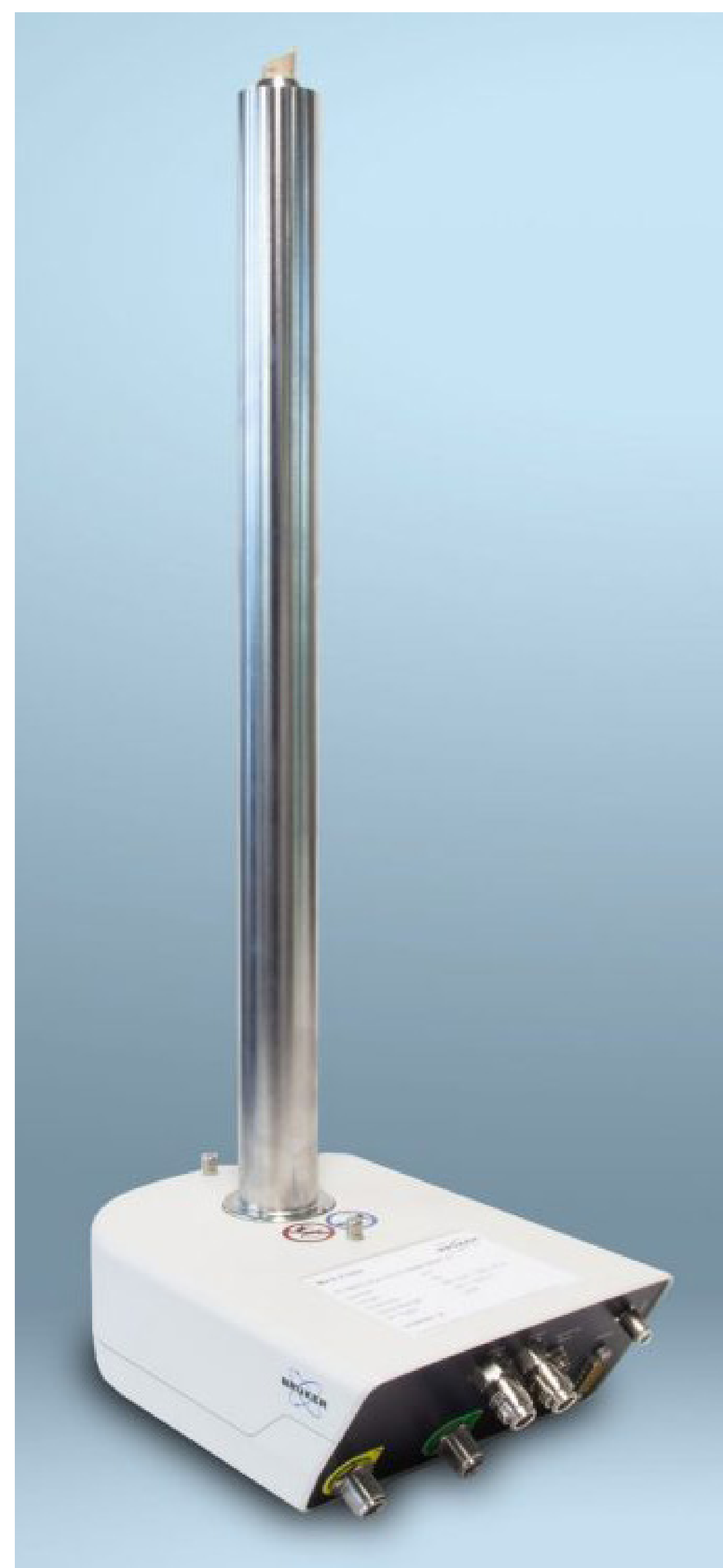
Fig 1: Bruker CPMAS iProbe

High Resolution Magic Angle Spinning (HRMAS) is the ideal technique to investigate many important classes of samples, such as gels, emulsions, foodstuffs, or biological tissues. With standard solution-state NMR techniques, the spectra of such samples would suffer from broad and unresolved resonances. By spinning at the magic angle, line broadening effects are removed, enhancing spectral resolution. Bruker's HRMAS iProbes are equipped with a gradient coil and a deuterium lock channel. The gradient makes a wide variety of NMR techniques accessible, including gradient enhanced solvent suppression and artefact-free homonuclear and heteronuclear 2D experiments.