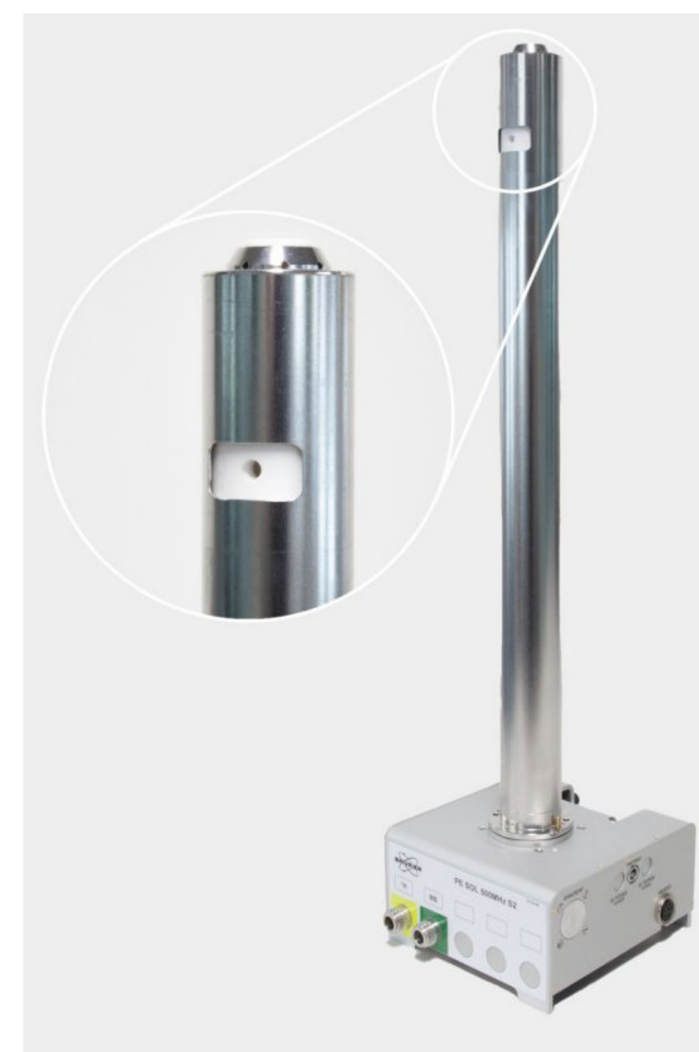
Fig 5: Bruker SB Static Probes