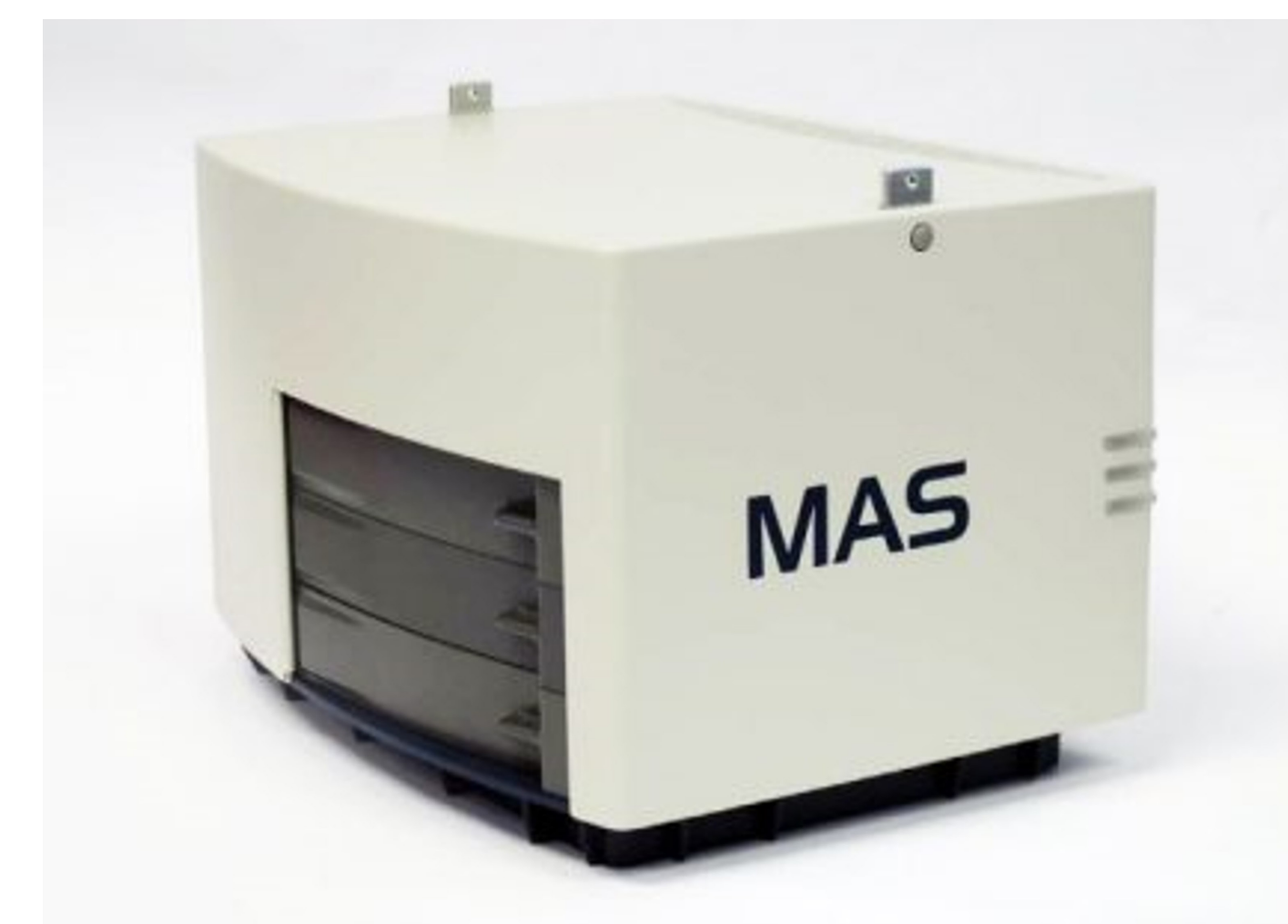
Fig. 3 MAS 3 Magic Angle Spinning Unit

Depending on which type of probe is connected to the spectrometer, the correct drive and bearing pressure profiles are automatically selected to ensure smooth spin-up and stable rotation. The MAS 3 unit is used for CPMAS, HRMAS, and MAS CryoProbes.