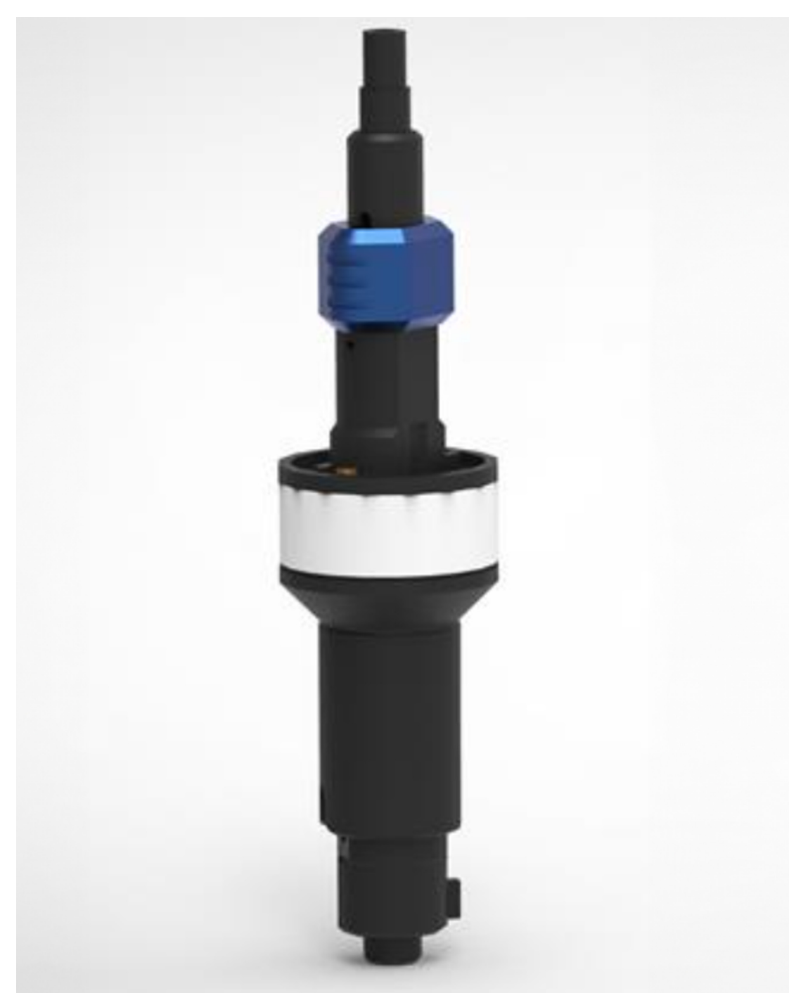
Fig 2: Bruker MAS Shuttle