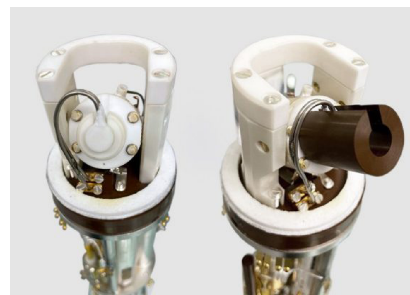
Fig 4: Bruker MASCAT Probes

As another example, Figure 5 shows a Bruker probe for static solid-state NMR. The samples are inserted into a cavity in the probe which is perpendicular to the magnet's B 0 field. Compared to Magic Angle Spinning (MAS) probes, static solid-state probes have a larger sample volume and longer RF coils, which both contribute to enhanced sensitivity.